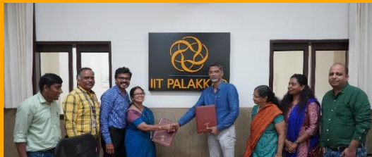
On 19 th Sep 2022, TECHIN of IIT Palakkad signed a MOU with GEC Wayanad