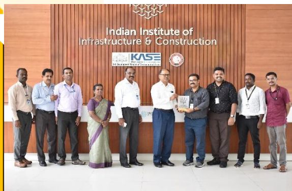
On 1 st October 2022 the TECHIN team visited to Indian Institute of Infrastructure & Construction Kollam

On 20 th Oct 2022 the automatic kjeldahl nitrogen estimation system installed in TECHIN wet lab. It is an assembly of equipment which is capable to analyse the Total Kjeldahl Nitrogen in water, wastewater, sewage water, plants, soils, food & feed, Fertilizers and pesticides samples. It is a combined unit and consist of Digestion unit, Distillation unit, Scrubber and Auto titrator. The system is comparatively pollution free, environmentally friendly, time saving and compact.