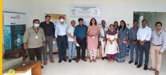
Governing Council members and Global delegates from BMGF at TECHIN office